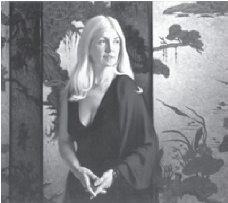
Marion , 1978, 37 x 42. Private Collection.