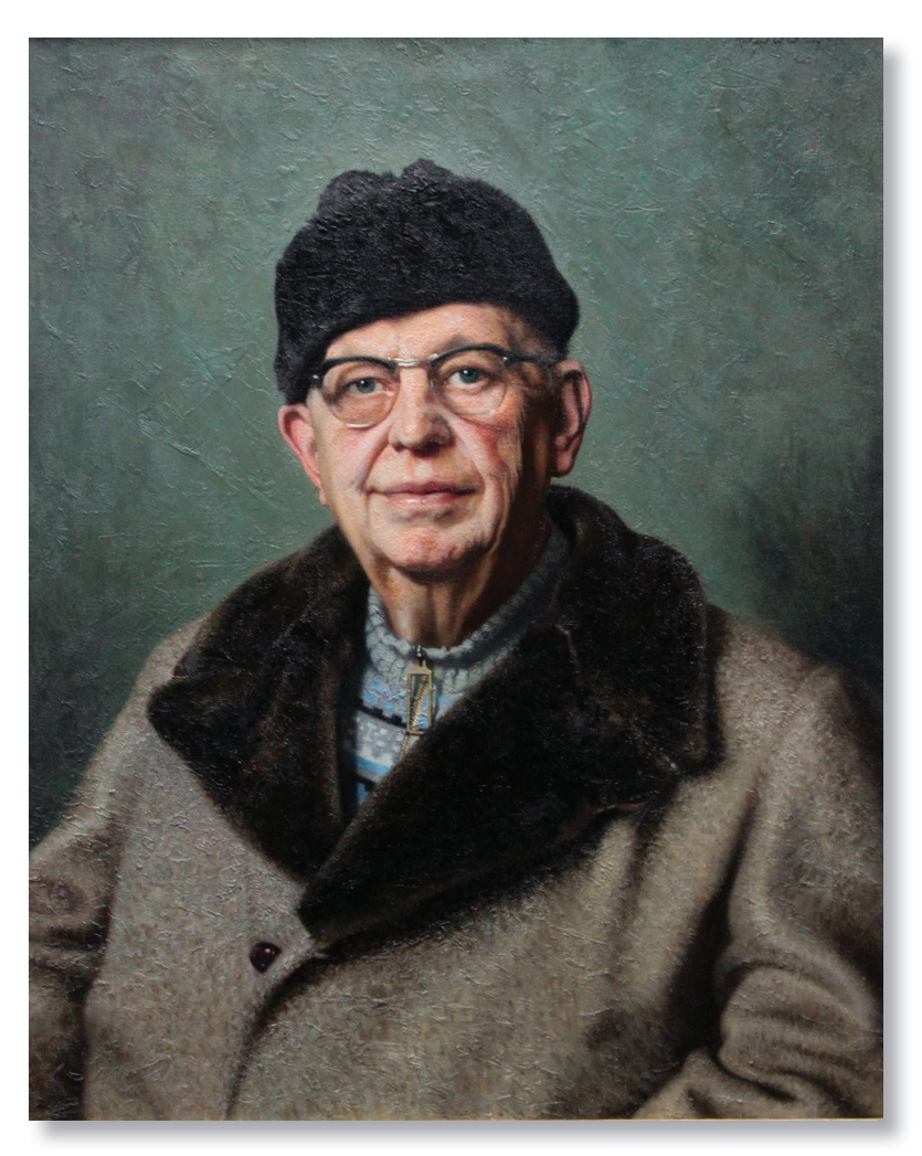
Dad , 1974, 30 x 24. Collection the Artist.